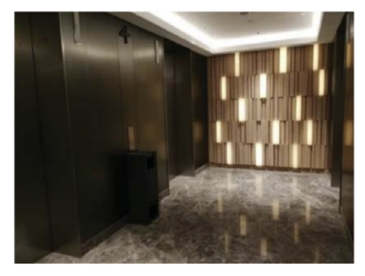
Interior of a commercial office space at DISTRii Singapore